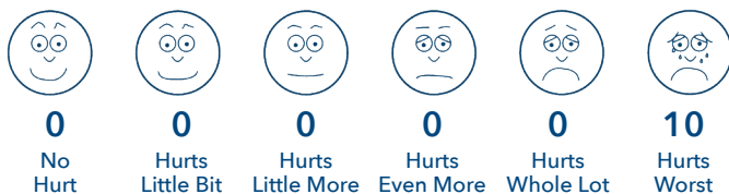
Wong-Baker FACES® Pain Rating Scale