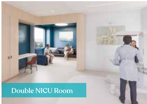
Double NICU Room